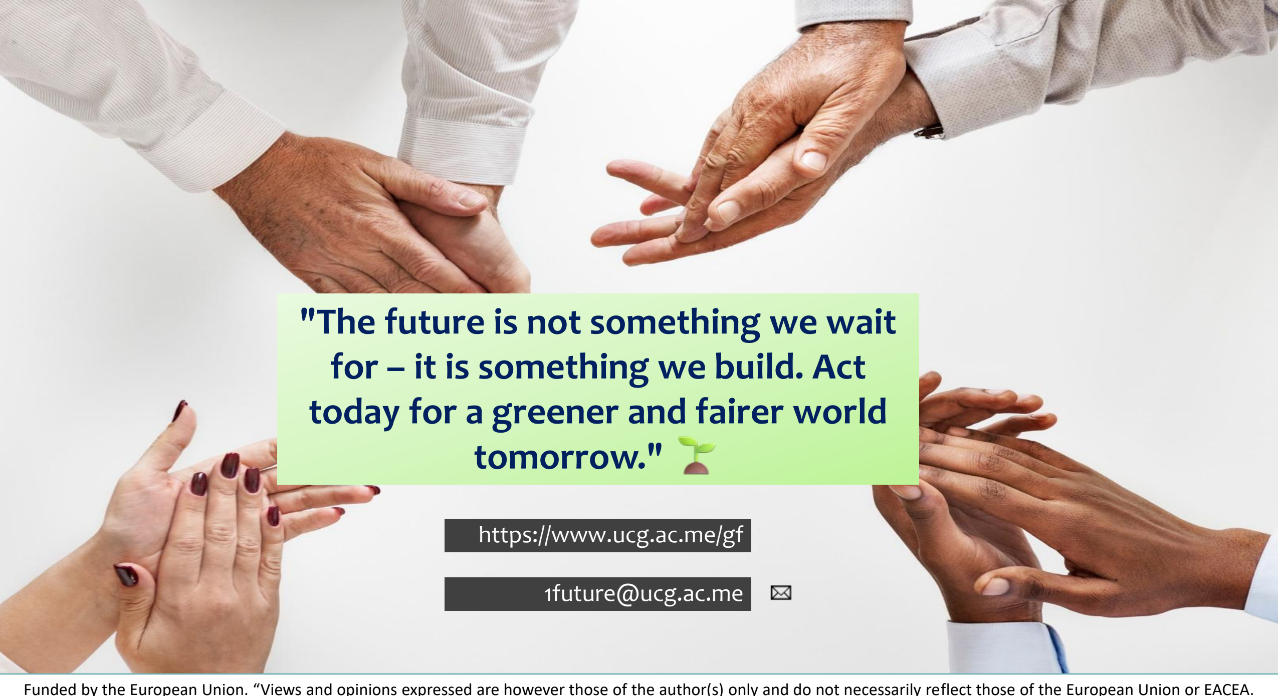
Funded by the European Union. "Views and opinions expressed are however those of the author(s) only and do not necessarily reflect those of the European Union or EACEA. Neither the European Union nor the granting authority can be held responsible for them"